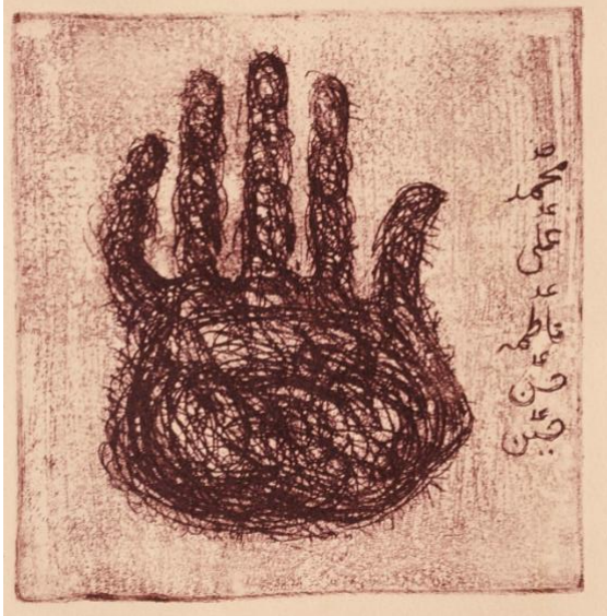
Zindaan Etching, print on paper 20 x 27cm 2004