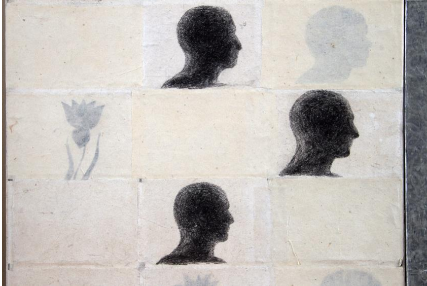
(detail) Graphite on Nepalese paper layered down on canvas 107 x 66 cm 2012

“...You cannot remove us from the minds (of people), and you cannot fade our message. You will never reach our glory and can never wash the stain of this crime from your hands. (Shahin, 2002)” --Lady Zainab’s sermon in the court of Yazid