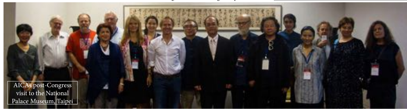
AICA's post-Congress visit to the National Palace Museum, Taipei

Additional information about the Congress, pre-Congress, and post-Congress events in South Korea is available at AICA South Korea's website . AICA South Korea also created two videos documenting the Congress and its related events. They are both posted on their YouTube page . You can also see many more photos from the events on AICA South Korea's Facebook page . The Journal of TFAM published the opening presentation for the one-day symposium at the Taipei Fine Arts Museum in its November 2014 issue.