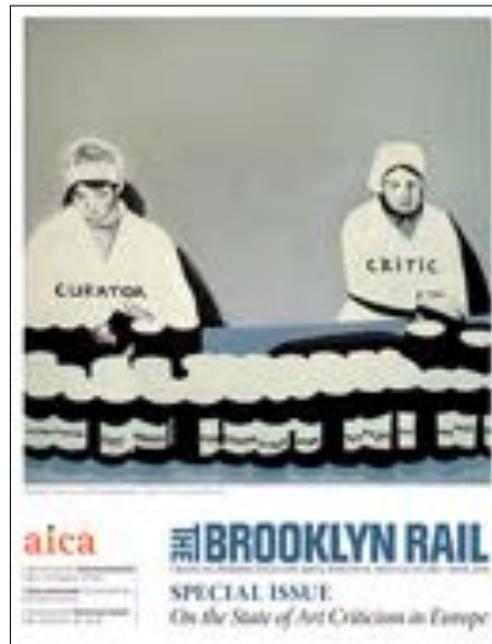
The May 2014 issue of The Brooklyn Rail . Cover art by the Krasnals: "Dream Fractory" (2011). Serigraphy, marker on canvas. 50 x 50 cm.

Last Spring, AICA International worked with The Brooklyn Rail to publish a special issue on art criticism in Europe.