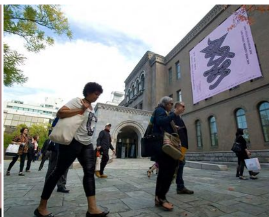
AICA's tour of the Seoul Museum of Art (SeMA)