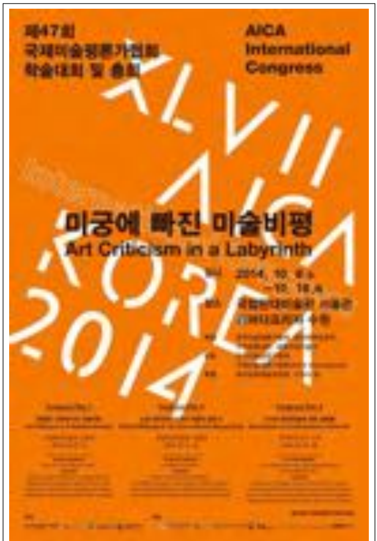
AICA Korea is publishing a collection of the papers delivered at the Congress that will be available through their website .

"Ultimately the experience of the Congress left the author of this report, and I suspect many of the other delegates, with a reinvigorated view of, and some renewed pride in the purpose, importance, and persona of the critic and criticism in the 21st century."