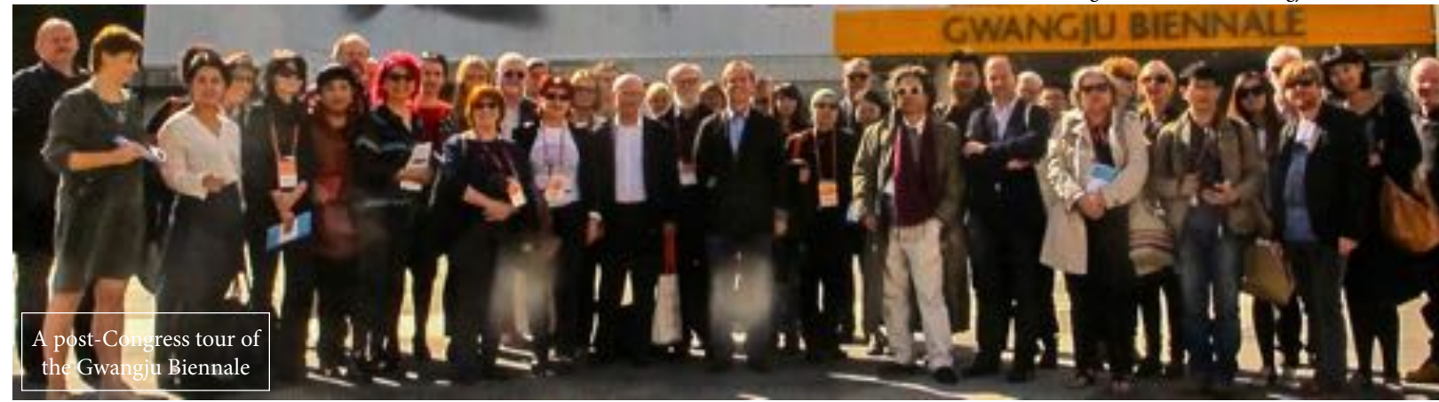
A post-Congress tour of the Gwangju Biennale