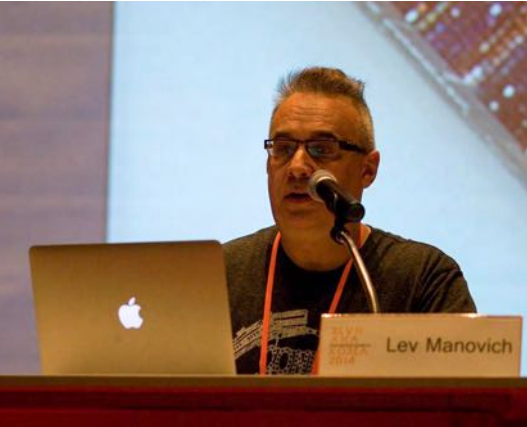
Lev Manovich, Keynote Speaker