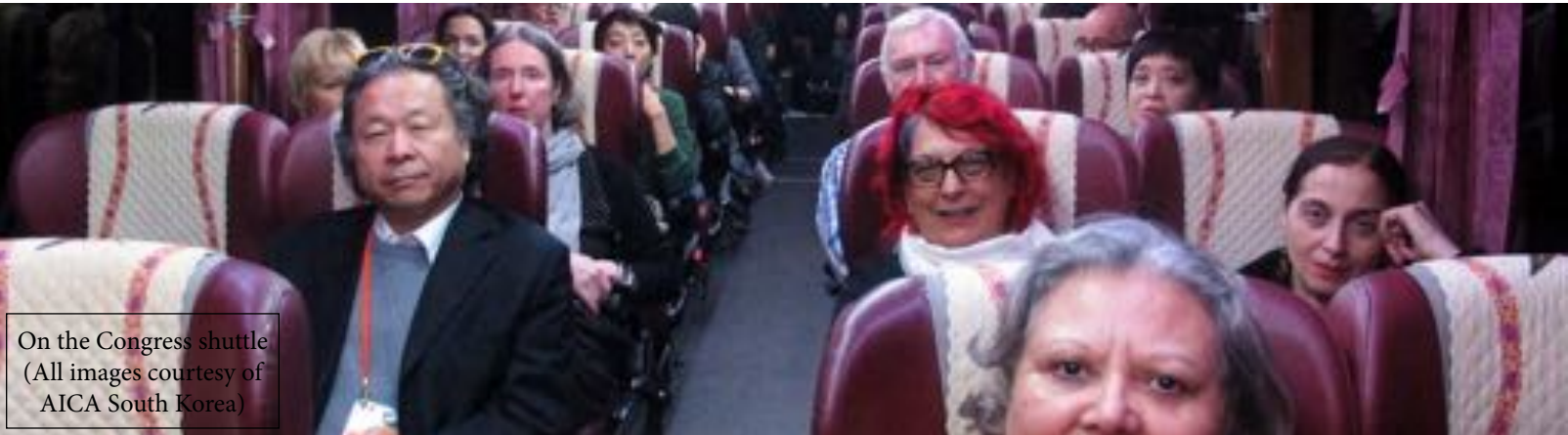
On the Congress shuttle