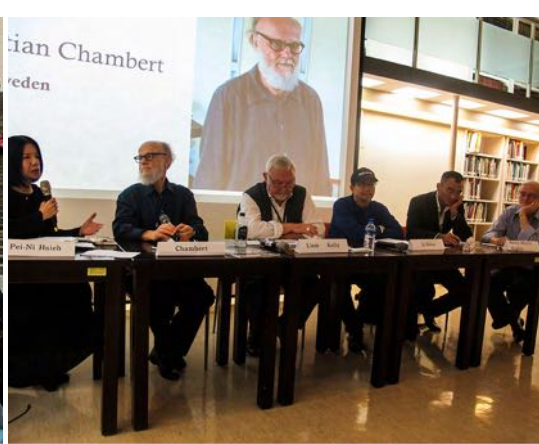
Panel discussion during a one-day symposium at the Taipei Fine Arts Museum